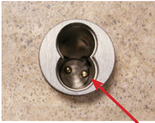
Figure 1 Prong position